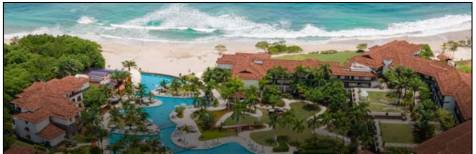
JW Marriott Guanacaste Resort